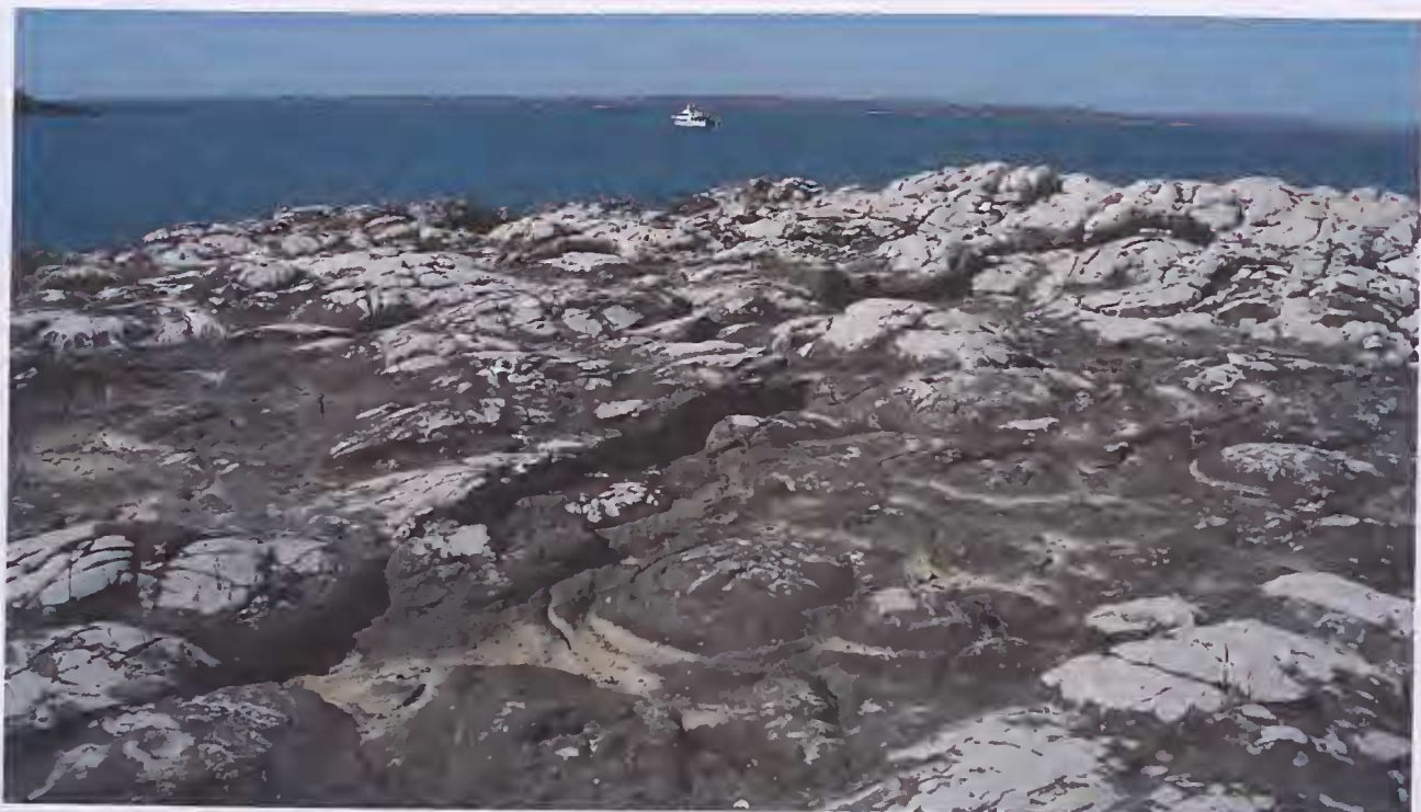
Figure 6. Top of the stromatolite dolomite forming a supra-littoral bench on a small islet south of Ngalanguru Island, High Clifty Group. Note the circular tops of large stromatolites in the foreground and the stark white crust over much of the rock surface. This surface appears to be the top of the dolomite sequence exposed by removal of the sandstone above it.